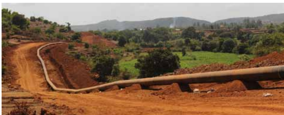
Preparing to lower-in the pipeline.