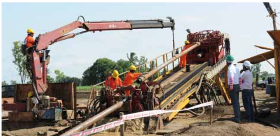
A crossing being completed with horizontal directional drilling.